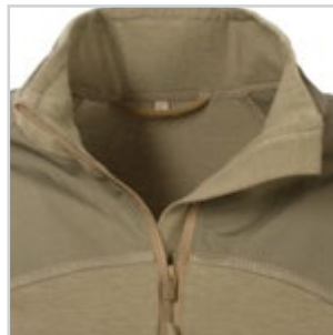
Adjustable zipper collar for ventilation