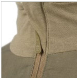
1/3 zip stand-up collar