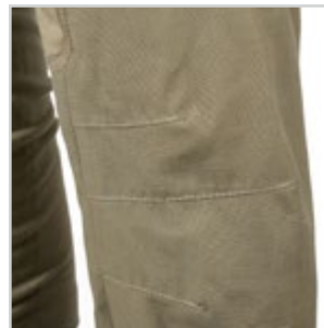
Articulated and reinforced elbows